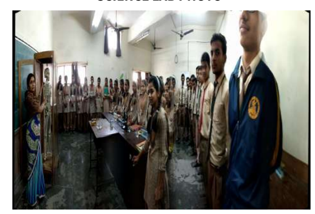
PHYSICS LAB PHOTO